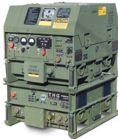
THG™ Integrated with TQG